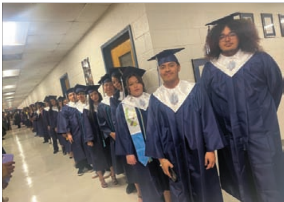
Congratulations to the 2025-26 winter graduates of Hillside High School.