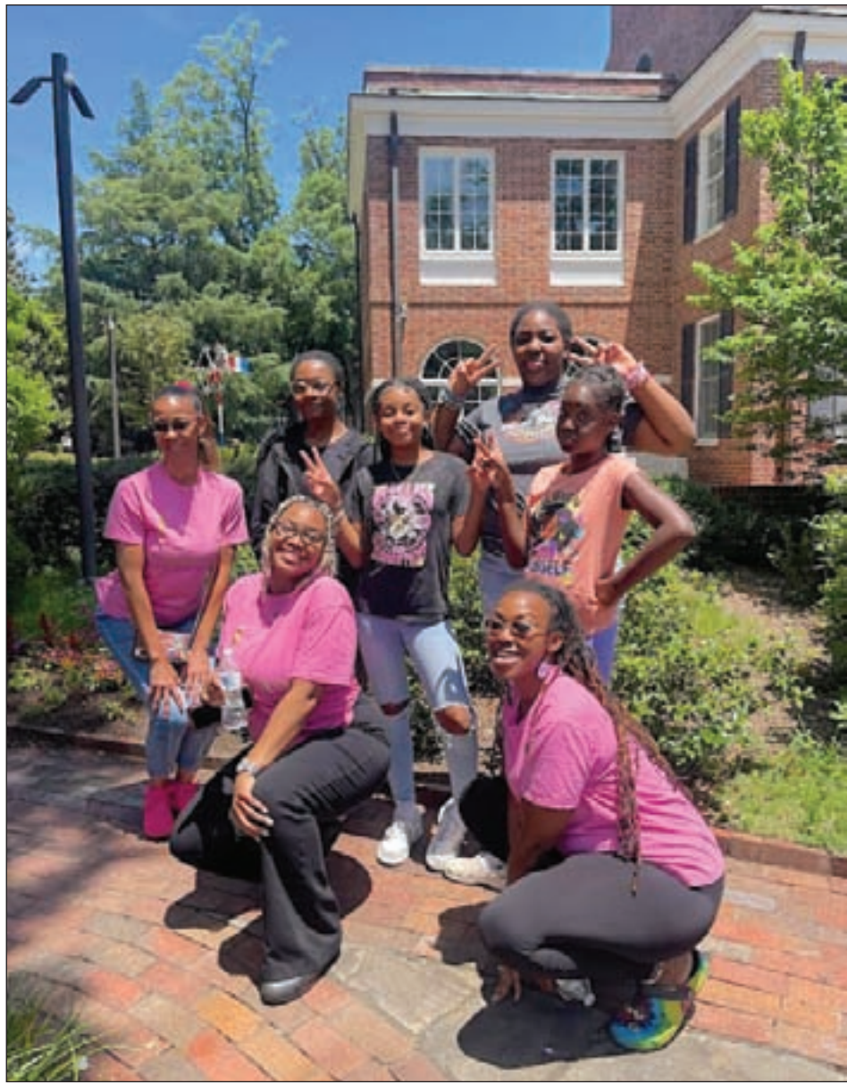
Sparkle Mentoring staff and members.