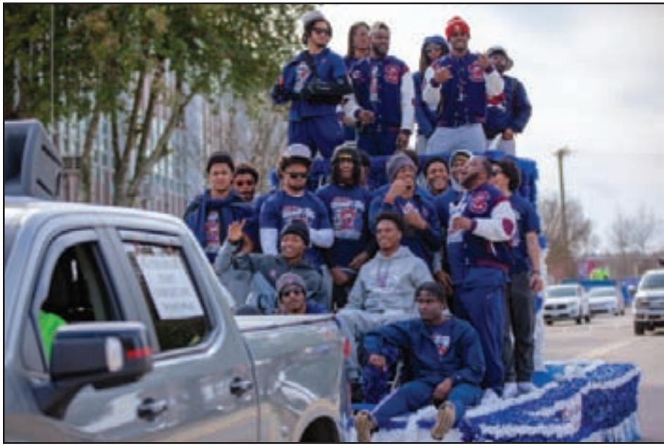
The championship football team.